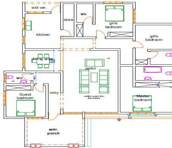
4 bedroom floor plan most prefer